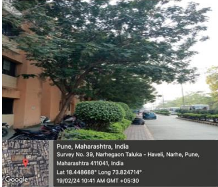
: Pedestrian Friendly Pathway