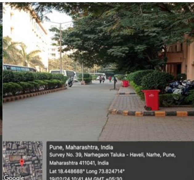
: Pedestrian Friendly Pathway