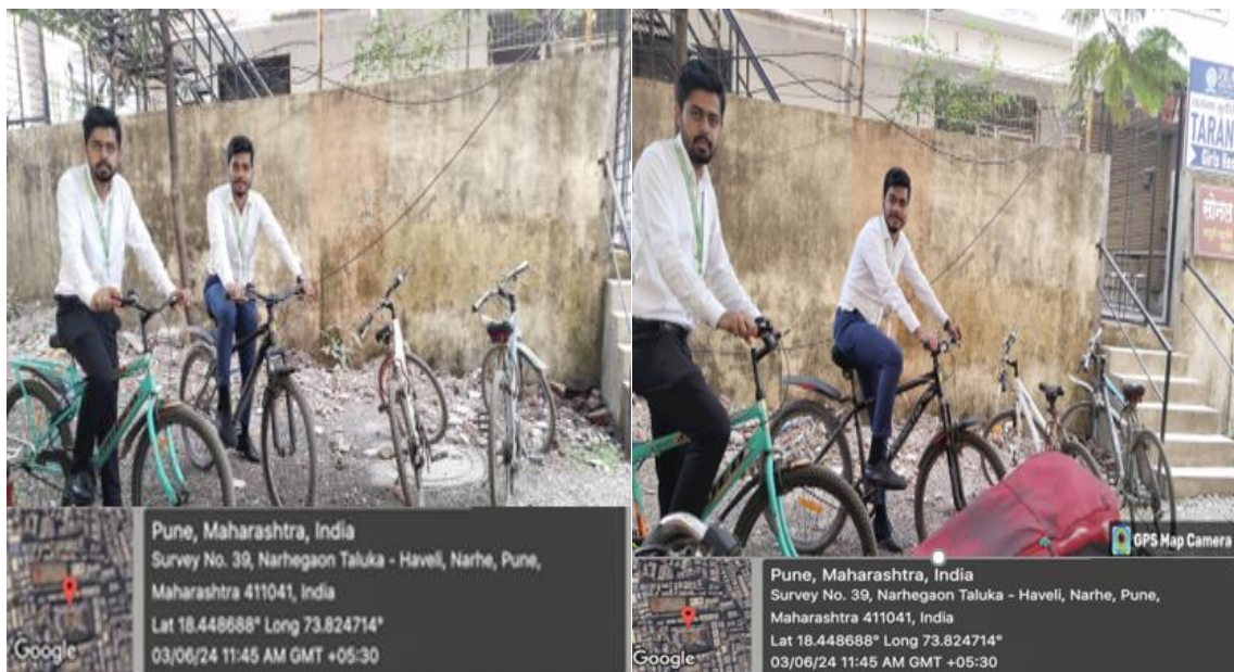
: World Bicycle Day celebration at ZEAL institute

Bicycles is an eco-friendly mode to commute and to promote the same Institute encourages the use of bicycle by organizing 'World Bicycle Day' every year which helps in creating awareness for pollution free campus, minimizing traffic problems and encourage fuel-saving. Institute stakeholders living in the vicinity area of the institute always prefer to ride the bicycle or come by walking to the campus.