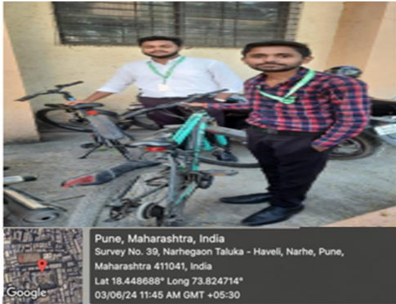
: Promoting sustainable transport and a healthy lifestyle.