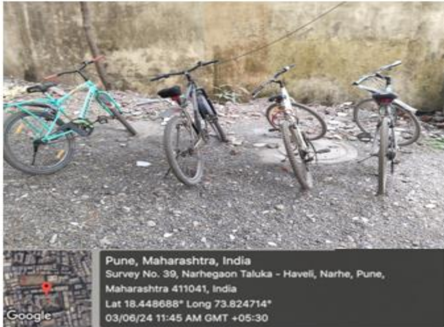
: Institute encourages the use of bicycle