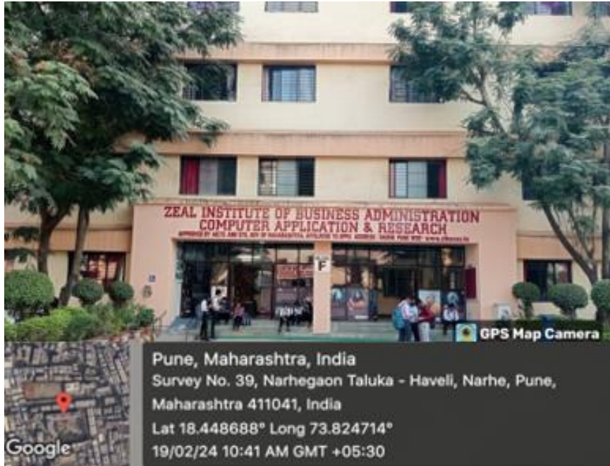
: Green Landscaping with trees and plants at ZES Campus