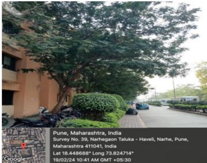
: Green Landscaping with trees and plants at ZES Campus

The entire ZES campus has landscaped with green lawn and shady trees making the campus green and pollution-free which enriches a good educational environment. Also institute creates awareness about pollution-free environment and the green campus by engaging activities like Swachh Bharat Abhiyan, Eco-friendly Ganesh Visarjan etc.