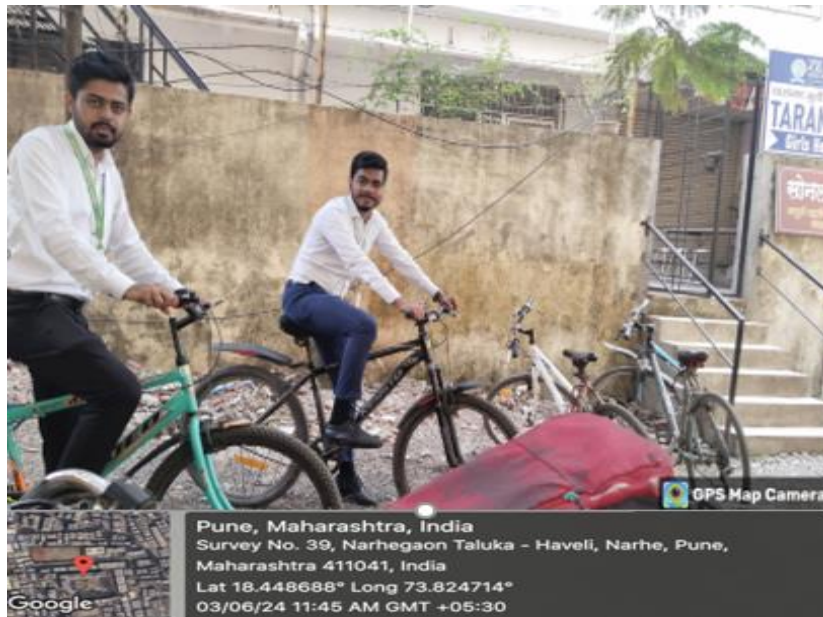
: World Bicycle Day celebration at ZEAL institute