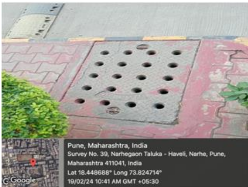
: Underground Drainage System at ZES Campus