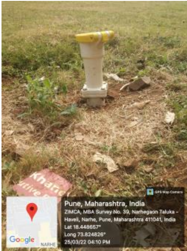
Image-7.1.1.8-Sprinkler System at ZES Campus

academic record etc. This initiative has helped in promoting paperless work culture at institute. To ensure quicker, effective and paperless communication with all stakeholders Institute has made it possible through various means like Microsoft Teams, WhatsApp groups and Official e-mail id & groups. The photocopying machine is used at office, staffroom and exam cell which has double sided printing facility, to save paper for printing. To create awareness about clean and green campus Institute is conducting/ participating in events like Swachh Bharat Abhiyan, tree plantation, ecofriendly 'Ganesh Visarjan'. For water conservation, bushes & green lawn near the playground is maintained using sprinklers and drip irrigation system.