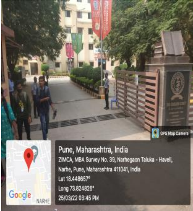
Image-7.1.1.1-Security at Main Gate