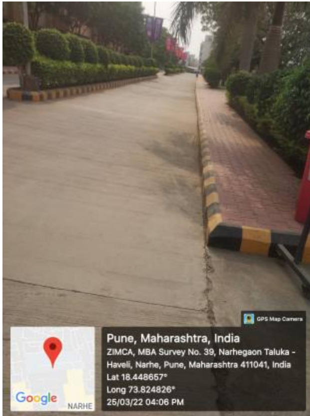
Image-7.1.1.11-Pedestrian Footpath at ZES Campus