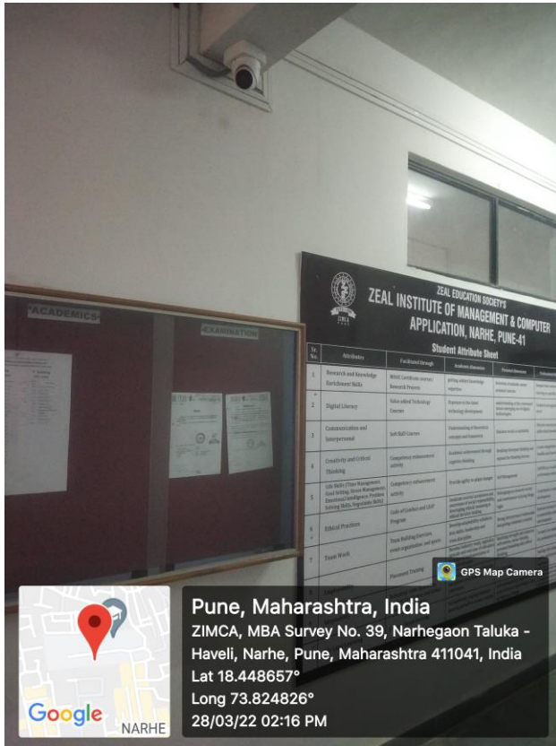
Image-7.1.1.3-CCTV at ZIMCA Corridor