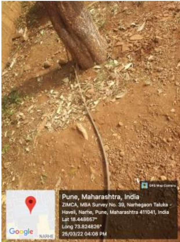
Image-7.1.1.9-Drip Irrigation Facility at ZES Campus