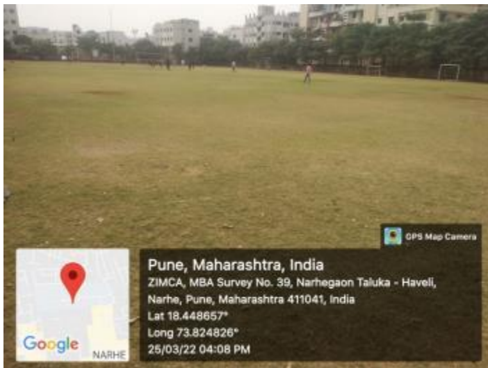
Image-7.1.1.10-Playground at ZES Campus