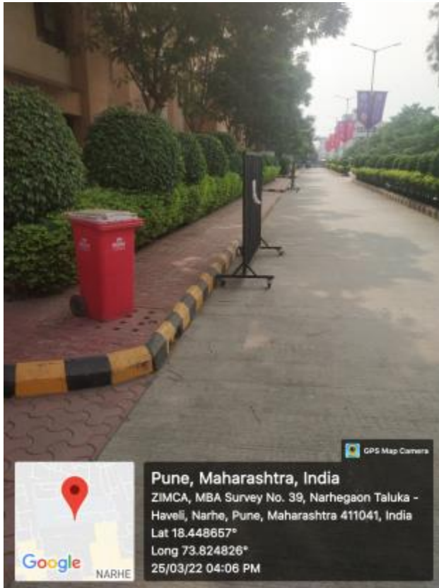
Image-7.1.1.12-Pedestrian Footpath at ZES Campus