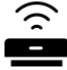
Jio Access Point