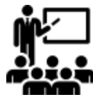
Class Room With LCD Projector