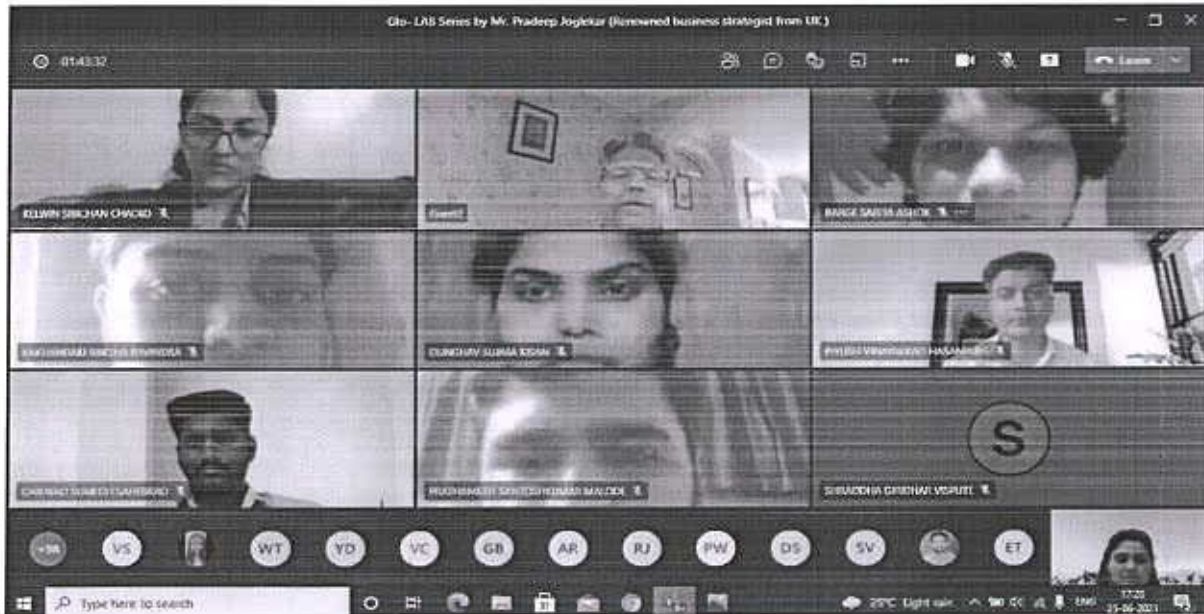
Students interaction during GLO-LAB I