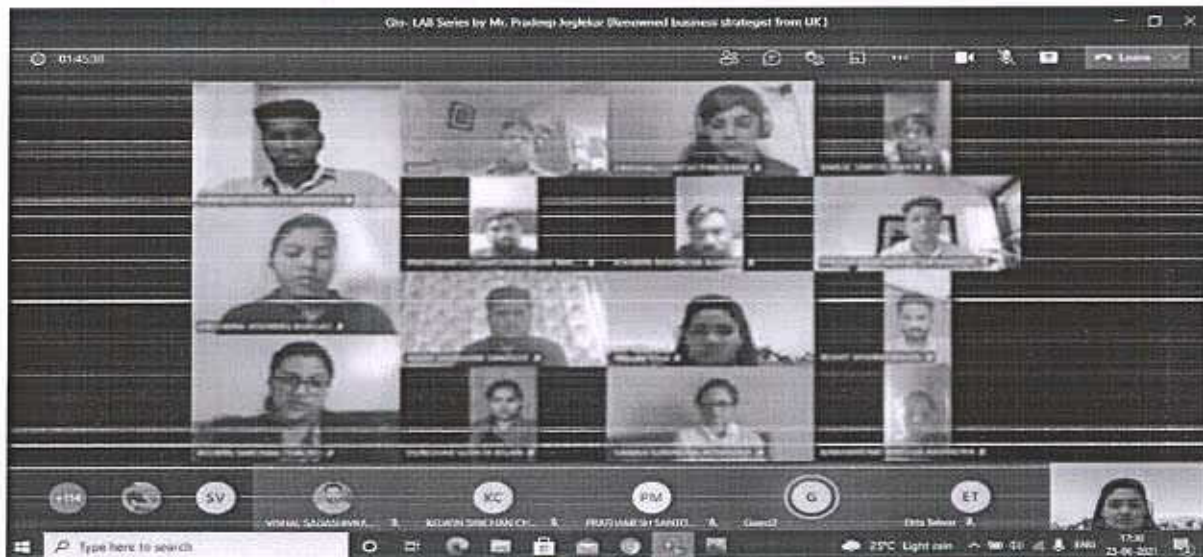
Students interaction during GLO9-LAB Series