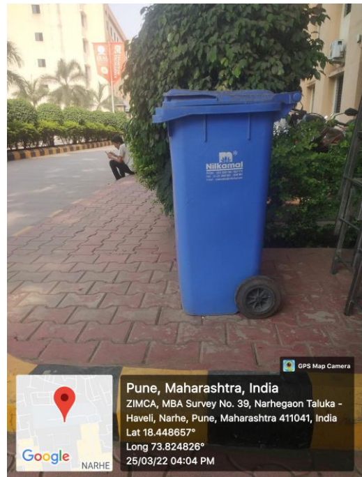
Image-7.1.3.1-Solid Waste Dustbin at ZES Campus