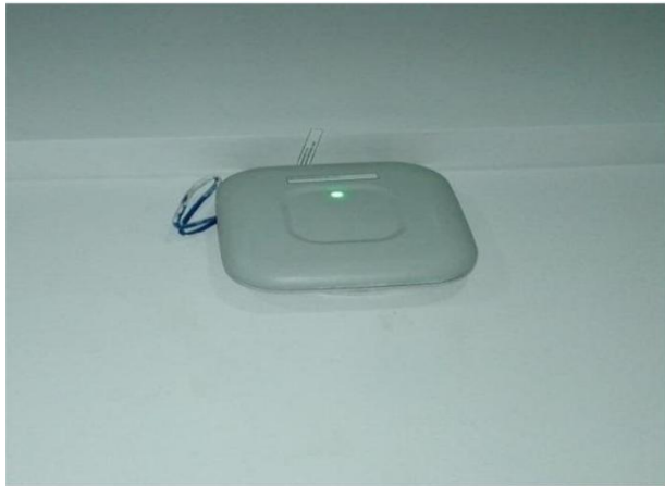
Jio Access Point

ICTs provide a variety of tools to support and facilitate teacher's professional competence. ICTs transform teaching and helps teachers to be more efficient and effective, thereby increasing their interests in teaching. The use of ICTs can assist in the organization and the structure of the course and course materials, thereby promoting rethinking and revision of curriculum. This helps students to carry out more independent work and gives the teacher more time to focus on teaching higher level concepts in the classroom. ICTs provide teachers with opportunities for experimenting with emerging technologies, thereby aiding in the provision of interesting and creative presentation of content. In ZIMCA all computers are connected with LAN and internet using CAT6 cables. It gives a wealth of information via connectivity of 35 Mbps to the entire. The institute has Wi Fi campus providing 24x7 internet facility. Wi-Fi enabled, enjoy the internet irrespective of where you are in the campus.