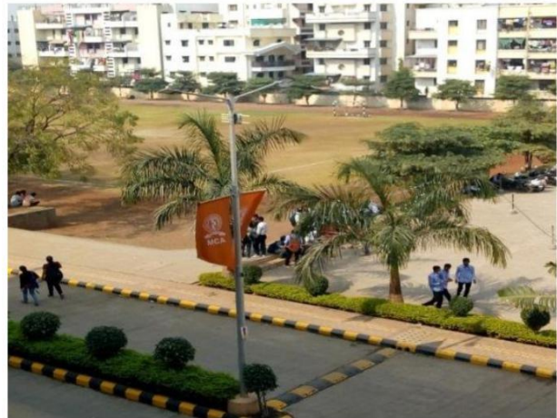
Wi- Fi Tower