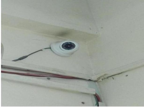
CCTV Camera in Exam Control room